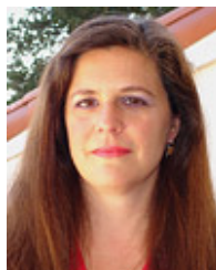
Leda Cosmides, Ph.D.